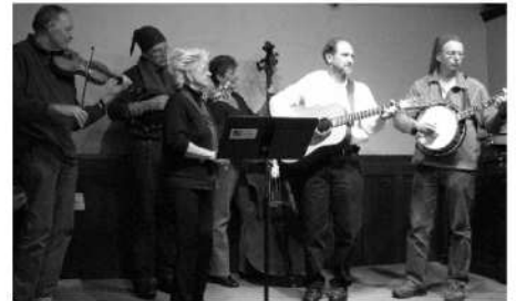
"INFERIOR STRING CUSSERS"