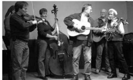
Warm-Up Band "HOT CIDERS"