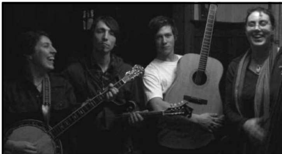
Skagway plays the VBA, Jan 27, 2008 ~ Details page 2.

The turnout for VBA events continues to be high. The Slow Pitch sessions, moderated circle jams, workshops, and concerts are always filled with enthusiastic participants. The cooperation and generosity folks show with each other, and with newcomers, is heart warming. The December 16 Band Scramble is the most recent example of so many folks helping make a really fun event possible. That all VBA activities (newsletters included!) are organized and run by volunteers says a lot about the members of VBA and how many pitch in to make the club the success it is. Way to go!